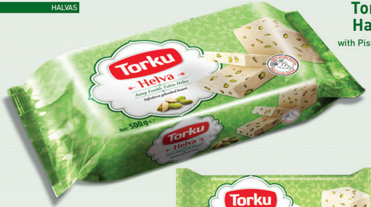
Torku Halva with Pistachio