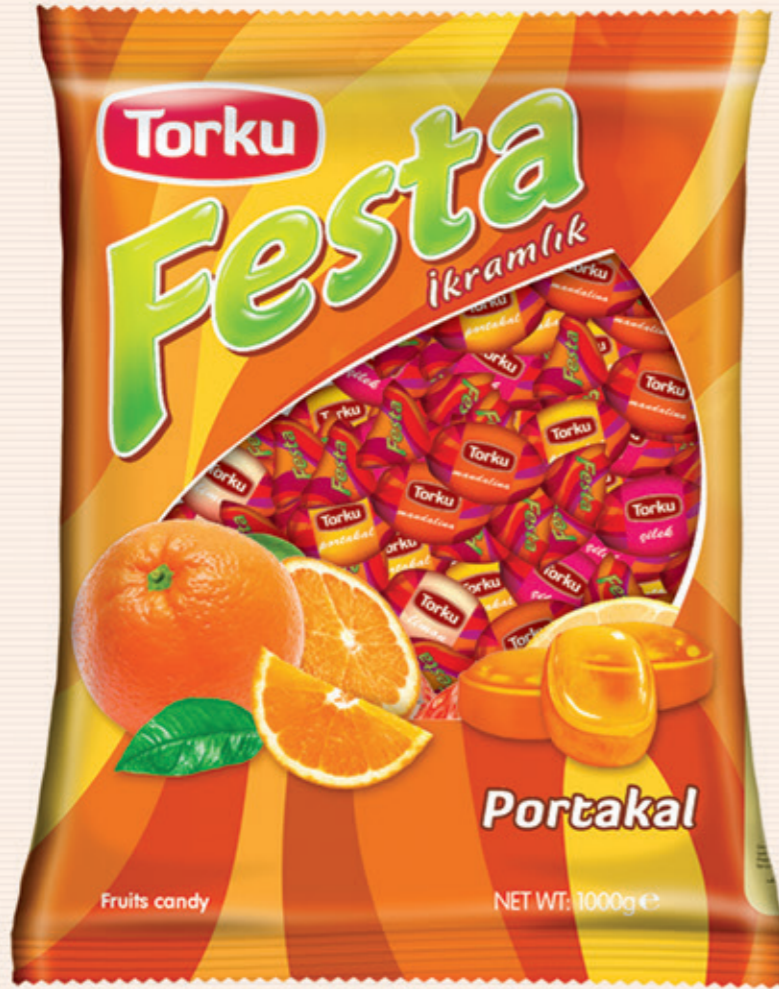
Torku Festa Classic Orange Flavoured Candy