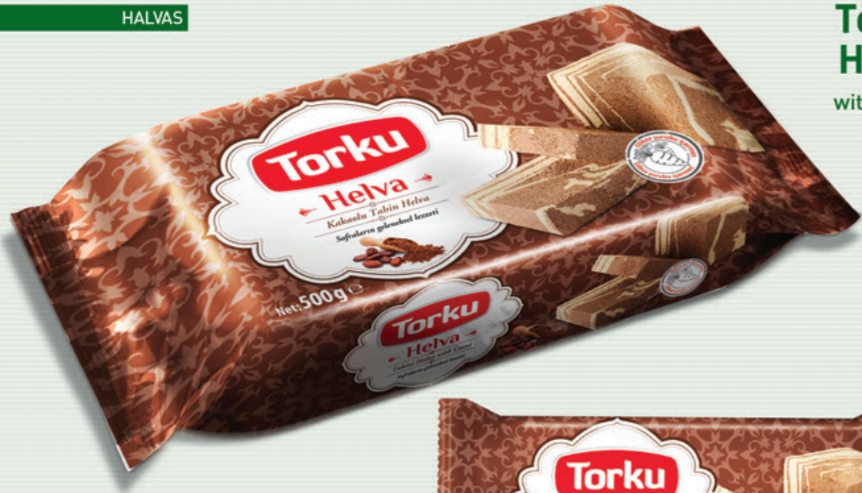
Torku Halva with Cocoa