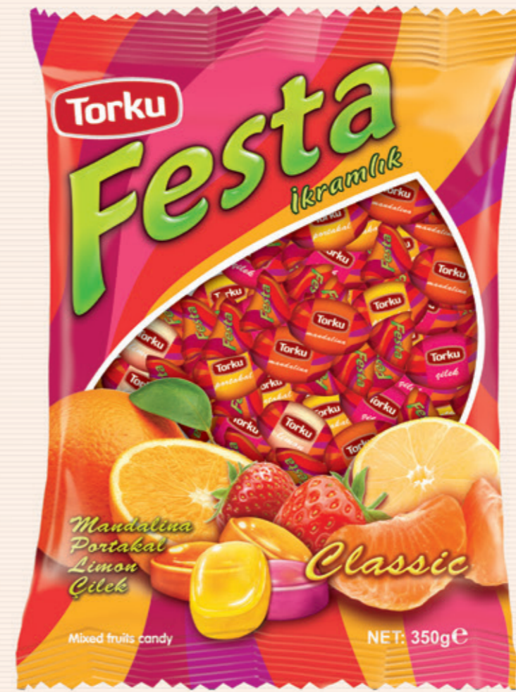
Torku Festa Classic

Fruit Flavoured Assorted Candy (Mandarin, Strawberry, Lemon, Orange)