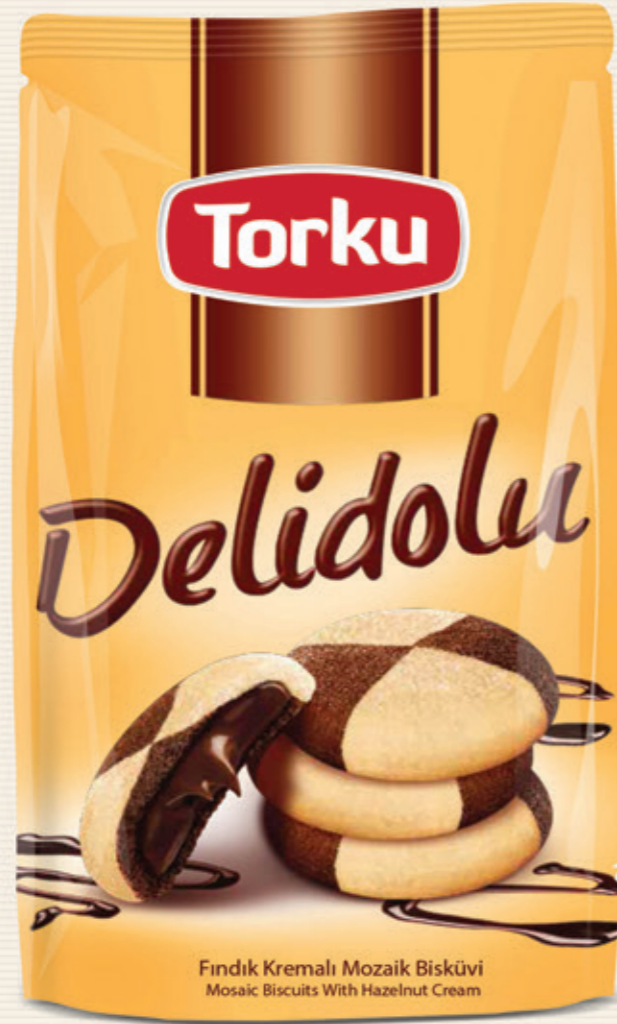
Torku Delidolu Mosaic Biscuit with Hazelnut Cream