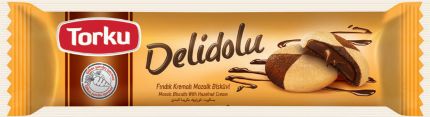
Torku Delidolu Mosaic Biscuit with Hazelnut Cream